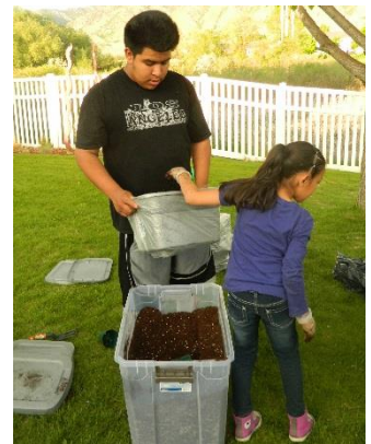
Figure 3 Children helped their parents overcome reservations about taking home their own vermicomposting (worm composting) kits

"There were full families that were so excited; these guys were so excited to take stuff home. Everyone was getting their hands dirty, their kids were out there... This little girl has spina bifida but she's still right there, hanging onto the bucket!"